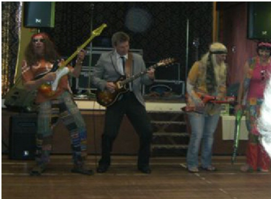
With apologies to the 'Mamas and Papas'